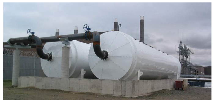
Novanergy's thermal energy storage reservoirs at IBM Bromont

Thermal energy is transferred into and out of the thermal storage reservoirs by a water/glycol thermal fluid circulated through heat exchange coils in the thermal storage reservoirs. The thermal fluid also transports